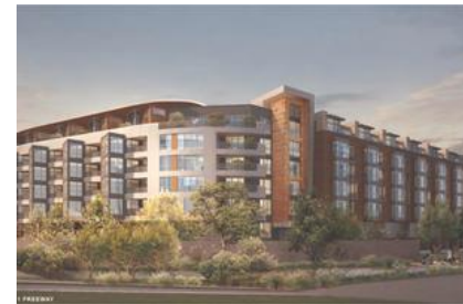
STUDIO T SQUARE

Plans include 303 units of apartments and condos spread across a pair of 7-story buildings sitting kitty corner from each other — 203 apartments will sit at the northwest end of the lot, closer to the highway, and 100 condominiums will be in the building to the southeast, adjacent to Terra Bella Avenue. Thirty apartments and ten condos are planned to be available at below-market-rate prices.